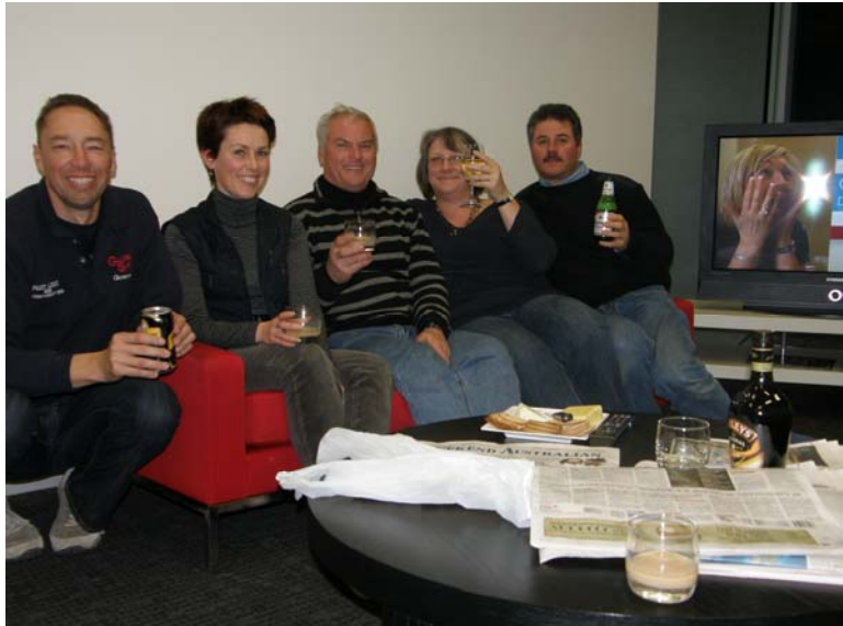
Relaxing in the Marina lounge with a bottle of Bailey's