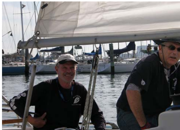
The two Mikes of Moody Blue