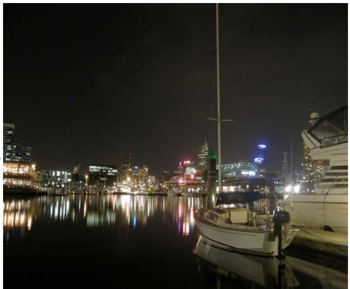
Shadow by night at Docklands

an overnight visit anytime you want a relaxing evening, especially mid-week as it can be a bit noisy Friday/Saturday nights. Then again, you can just adjust the dosage of Bailey's or whatever is your tipple and you won't hear a thing. Right now it's really easy to book (96588738) but I suspect it will not be that way forever.