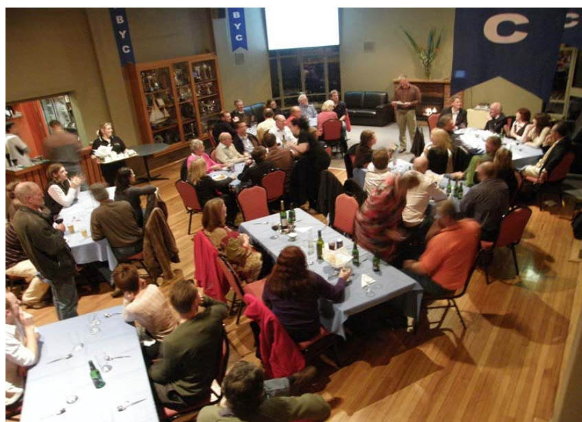
Presentation Night was held this year in May with 50 people in attendance

Membership subscriptions for 2008-09 are now due and payable before the AGM. Please see enclosed subscription form for details.