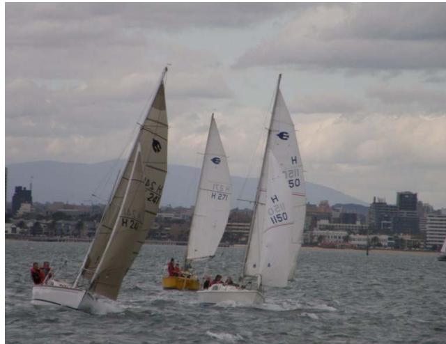
Drambuie, Warranilla and MoodyBlue, Race 1