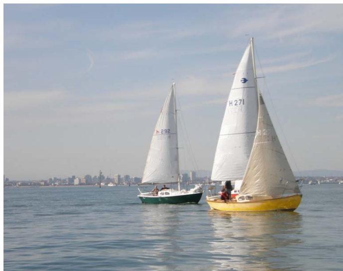
Revel and Warranilla in mill-pond conditions, Race 2