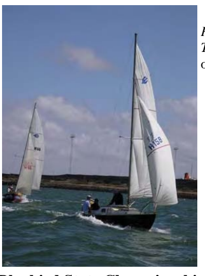
Paramour behind Tandeka before the start of Race 2