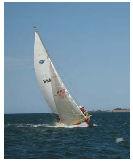
Paramour approaching the finish line at Geelong.

Kotare (H 85) has a new owner and we hope to see this yacht competing against other Bluebirds in the near future.