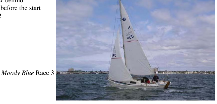
3 minutes ahead of Bounty (6th).

The 2nd BYAV State Titles race last Sunday was once again interesting and close. In 20 to 25 kt southerly winds, Paramour came in first (again) by 3 to 4 minutes from 2nd placed Secret who was about 3 minutes ahead of Tandeka (3rd) by 20 seconds from Shadow (4th) with another 20 seconds to Warranilla (5th) and about