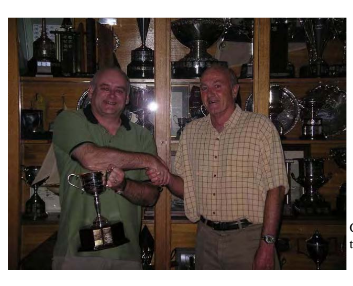
Bluebird Cup trophies – Be in it to win it for 2007

A few of the Bluebirders and families enjoying themselves at the 2006 end of year festivities.