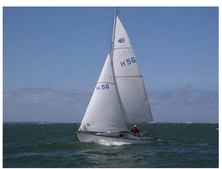
Bounty preparing for the start of Race 2 of the 2007 Bluebird State Titles.