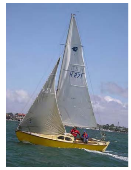
Warranilla Race 2

Congratulations again to Ivan on winning, to the minor place getters and to all the Bluebirds who competed. It was a great series – no races had to be cancelled and there was plenty of wind in each race. Everyone was up there at some stage with 5 different winners from the 5 races (Paramour won 2 but there were 2 winners in the last race – see above).