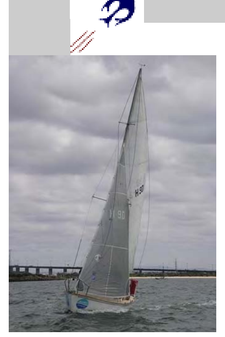
Secret Race 3

Bounty, ahead of Moody Blue, followed by Paramour, Jay, then Shadow, with Secret keeping look-out at the rear to ensure there were no casualties along the way - thanks Jock. There was only about 7 minutes separating 1st from 5th - that's around a 2% difference, showing again the closeness of the competition.