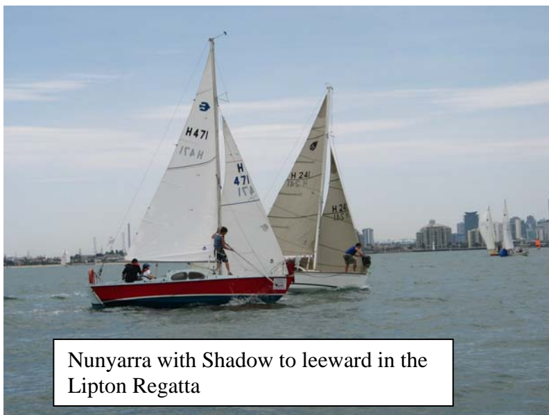
Nunyarra with Shadow to leeward in the Lipton Regatta