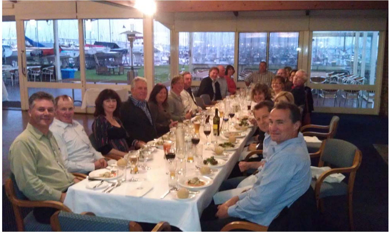
Members of the BYAV enjoy a relaxing meal on the eve of the AGM in October